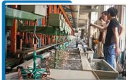
6. ELECTRIC PLATING