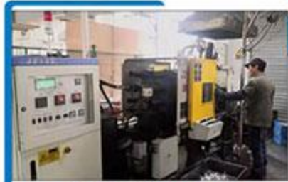
2.DIE CASTING MACHINE