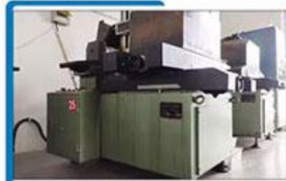
4.WIRE CUTTING MACHINE