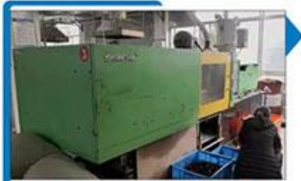
1.INJECTION MOLDING MACHINE