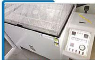
7.SALT SPRAY TESTER