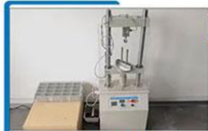
8. TENSILE TESTER