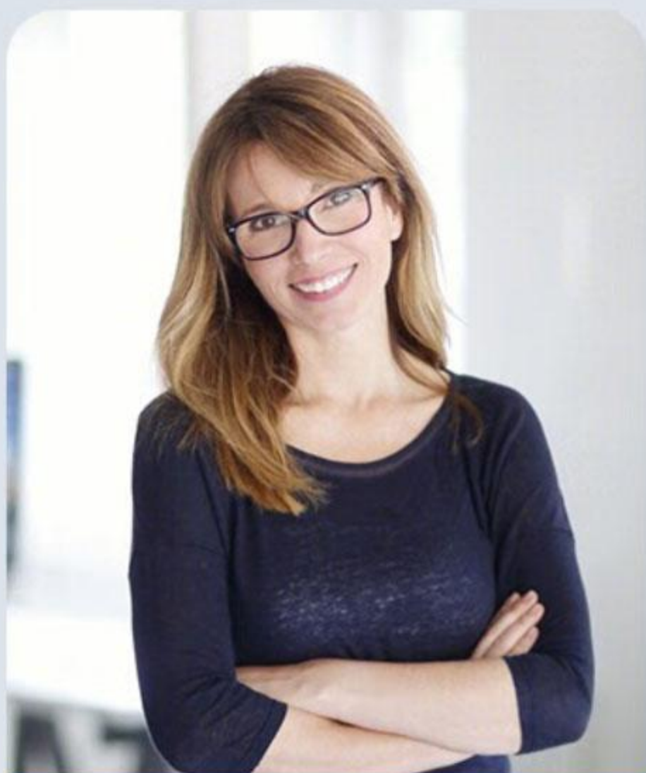
Dual infrared night vision Peephole