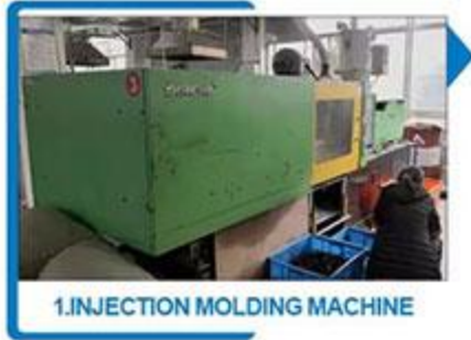
1.INJECTION MOLDING MACHINE