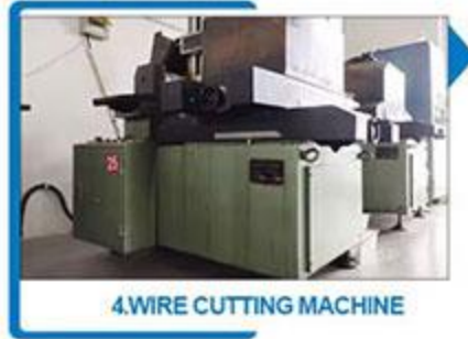
4.WIRE CUTTING MACHINE