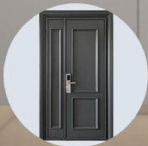
Aluminum alloy doors