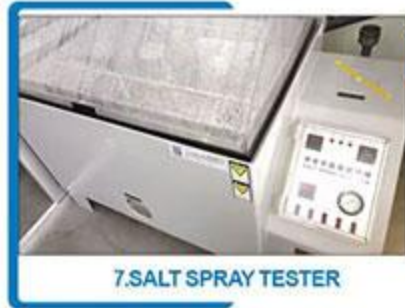
7.SALT SPRAY TESTER