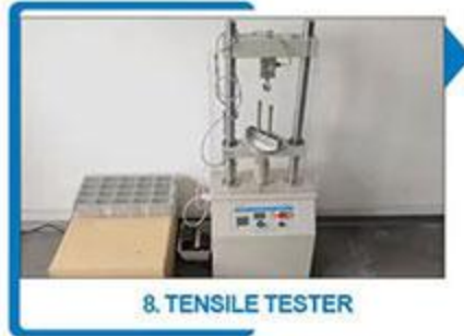
8. TENSILE TESTER