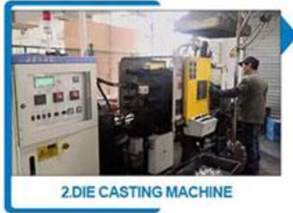
2.DIE CASTING MACHINE