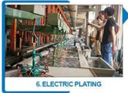
6. ELECTRIC PLATING