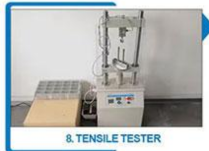
8. TENSILE TESTER