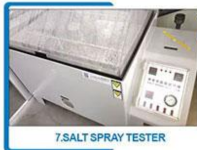
7.SALT SPRAY TESTER