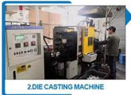
2.DIE CASTING MACHINE