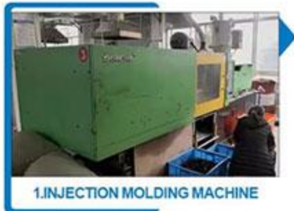
1.INJECTION MOLDING MACHINE