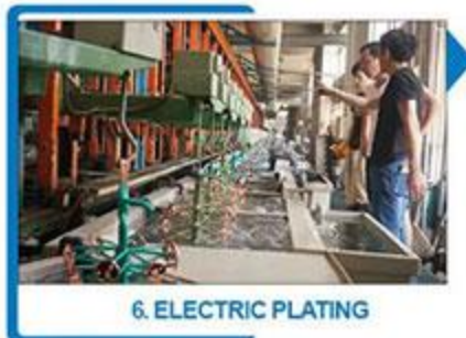
6. ELECTRIC PLATING